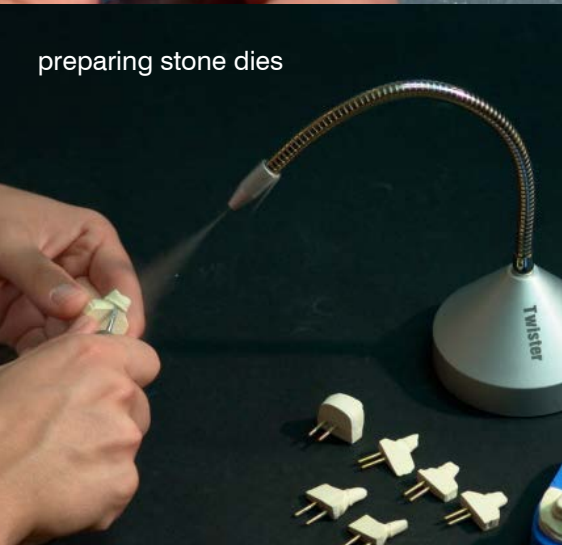
preparing stone dies