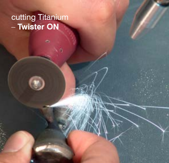
cutting Titanium – Twister ON