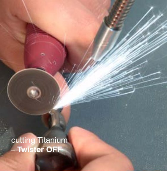
cutting Titanium – Twister OFF